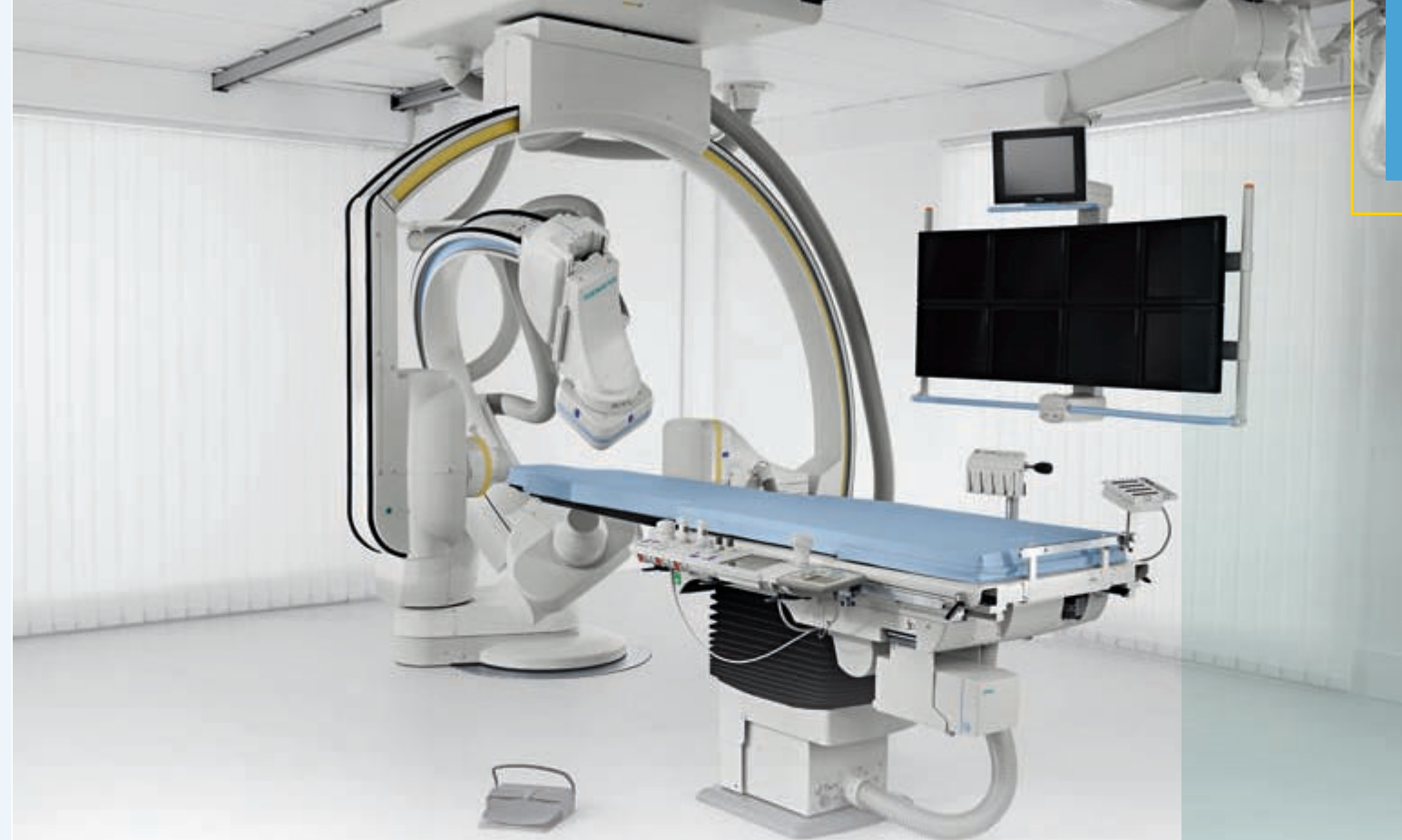
Siemens Artis Zee Biplane Imaging System