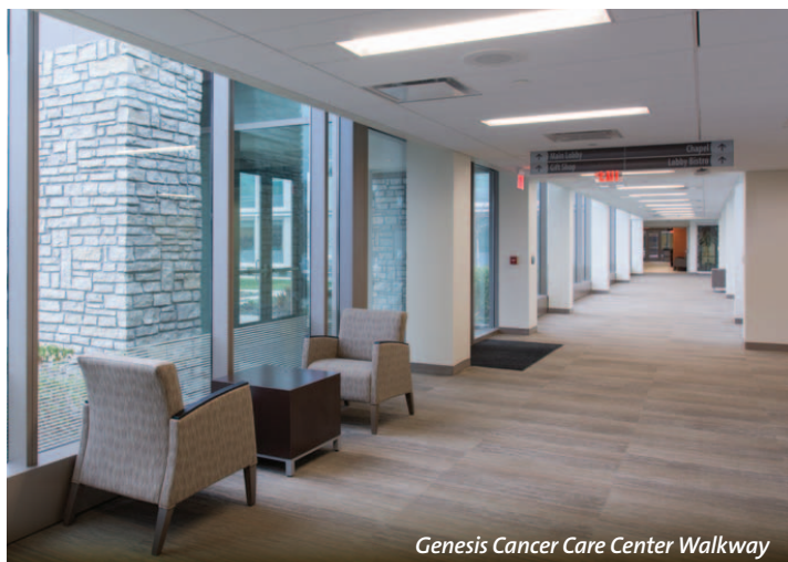
Genesis Cancer Care Center Walkway