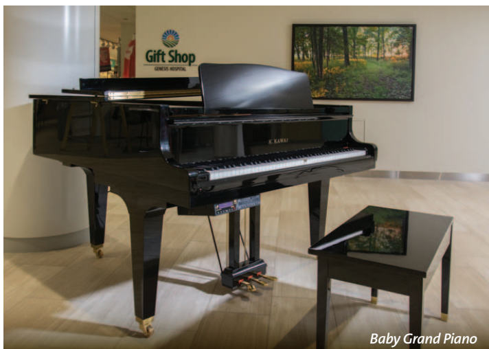
Baby Grand Piano

Your new Genesis Hospital officially opened June 27, 2015. While most of the construction work had been done at the time, there were a few areas to complete. Here's a look at the finishing touches we have made to your Genesis Hospital.