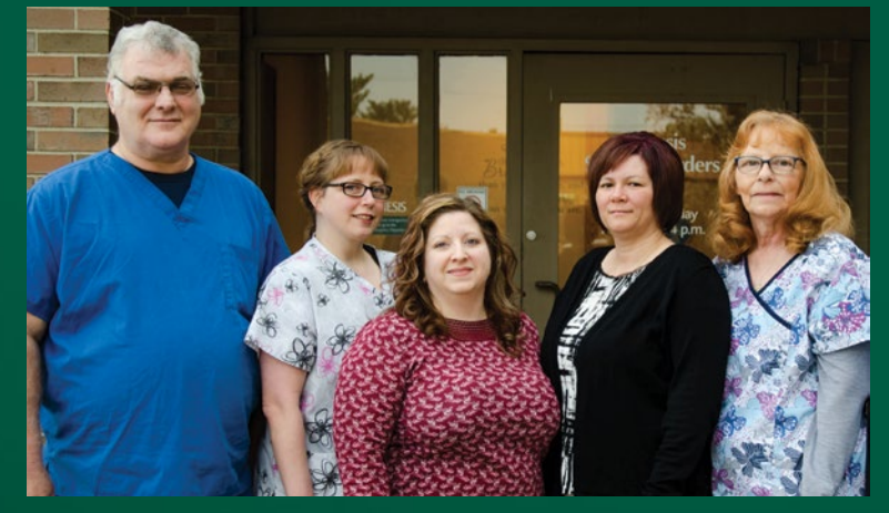
Sleep Disorders Center staff are pictured in front of the Center.

Sleep studies are also available for periodic limb movement, REM sleep behavior and circadian rhythm sleep-wake disorders. Patients might also require a "nap study" that happens after the overnight test and lasts all day. In the study there are a series of four or five 20-minute naps, with breakfast and lunch provided.