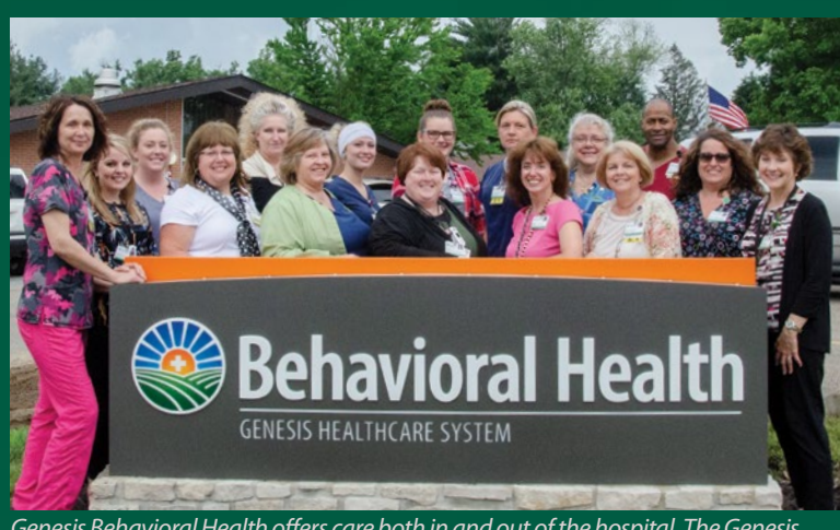
Genesis Behavioral Health offers care both in and out of the hospital. The Genesis Behavioral staff are pictured at the facility, located behind Genesis Hospital.

If community members don't need a hospital stay, our Outpatient Behavioral Health provides intensive outpatient group therapies and medication management. The therapies provide short term, supportive therapy to help cope, manage stress, increase self-esteem and improve communication and relationships.