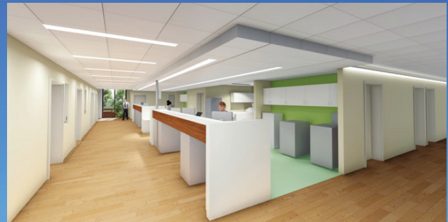
A modern nurses' station in the Emergency Department is one of the features of the new medical center. The full-service ED will include: 24/7 emergency care including heart attack, stroke, complex medical conditions and serious injuries; board-certified ED physicians; and specially trained RNs.