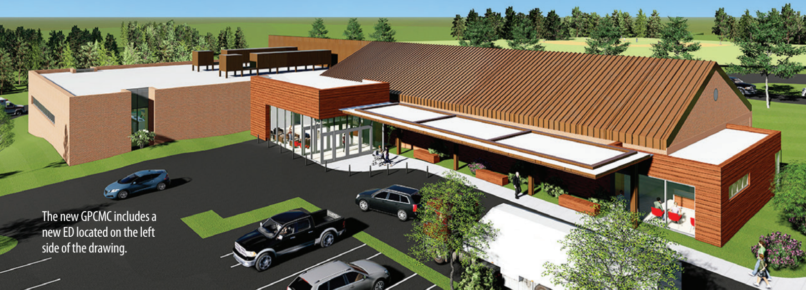
The new GPCMC includes a new ED located on the left side of the drawing.