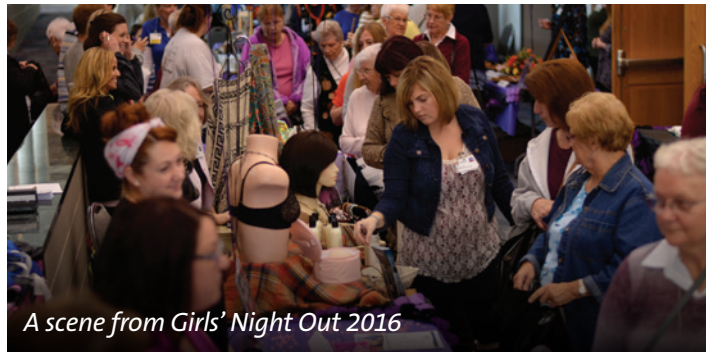
A scene from Girls' Night Out 2016