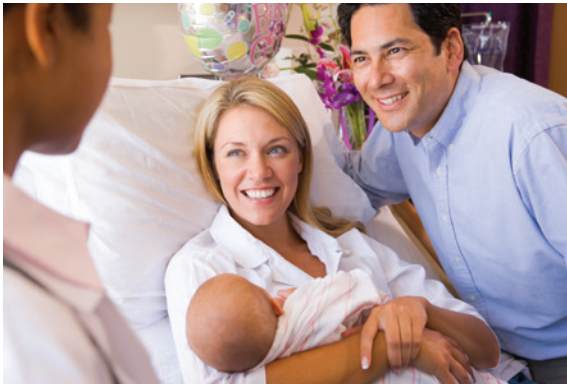
Partnering to Help Parents

A weekly support group, called Breastfeeding Support for Success, is also offered at no cost. Infants receive a weight check during meetings, and professional lactation consultants answer mothers' questions. The group is open to all mothers in the community – whether they choose to breastfeed or bottle feed. Mothers planning to return to work can also schedule a free consultation designed for their specific work situation.