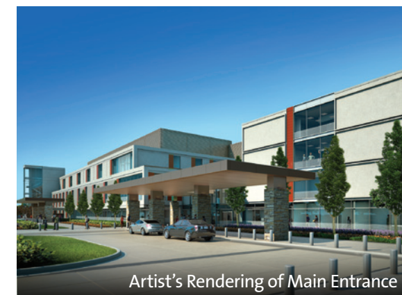
Artist's Rendering of Main Entrance

To Learn More » Visit genesishcs.org and select "Building For Your Health" for an interactive virtual tour, videos and a webcam that gives you real-time photos of construction.