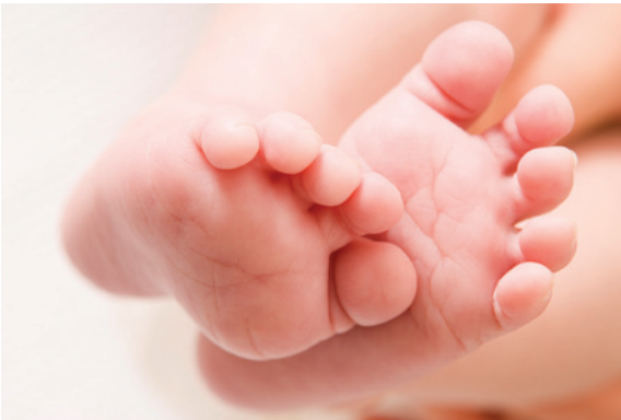
Healing After Infant Loss (H.A.I.L.)

Genesis began a program in 2013 to identify at-risk infants early. This helps babies get treatment to relieve painful withdrawal symptoms, improves the health of the infants and provides parents support and education to help care for the infants.