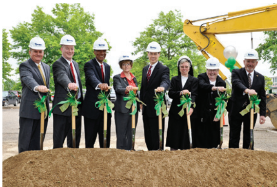
Groundbreaking – May 11, 2013