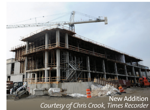
New Addition

The Bethesda Emergency Department closed June 30 to allow for expansion of the site where the addition is being built and renovation of the space that housed the Emergency Department. Emergency care was consolidated at the Good Samaritan Emergency Department, which was redesigned to accommodate more patients and visitors. Genesis' two FirstCare centers remained open for urgent medical needs.