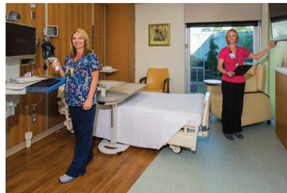
Designing Patient Rooms