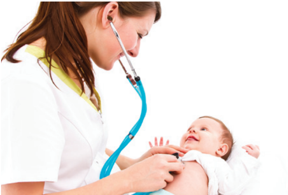
Identifying At-risk Infants

The Genesis Maternity Care team receives special training on services and resources available in the community for mothers, infants and children. The training helps the team connect new mothers with resources while they're still in the hospital, such as assistance for teen moms, education on child development, or availability of nutrition programs.